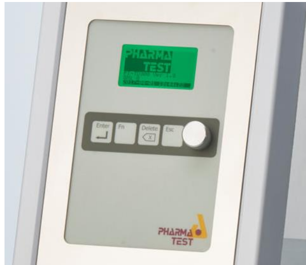
Navigate the menus using a click wheel

A USB flash drive can be connected to the instrument to save and load methods in .csv-format. Print-outs can be stored as text files. Furthermore instrument firmware updates can be installed and factory settings be restored by using the flash drive without the need for any PC or programming tool.